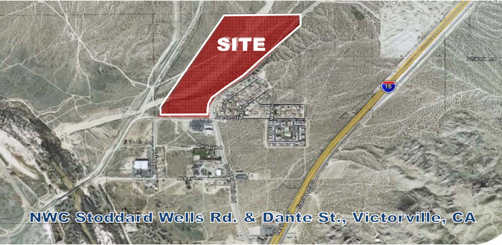
NWC Stoddard Wells Rd. & Dante St., Victorville, CA